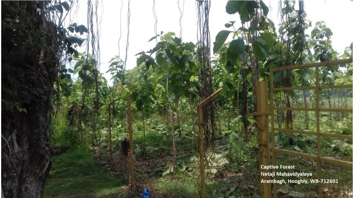
Captive Forest Netaji Mahavidyalaya Arambagh, Hooghly, WB-712601