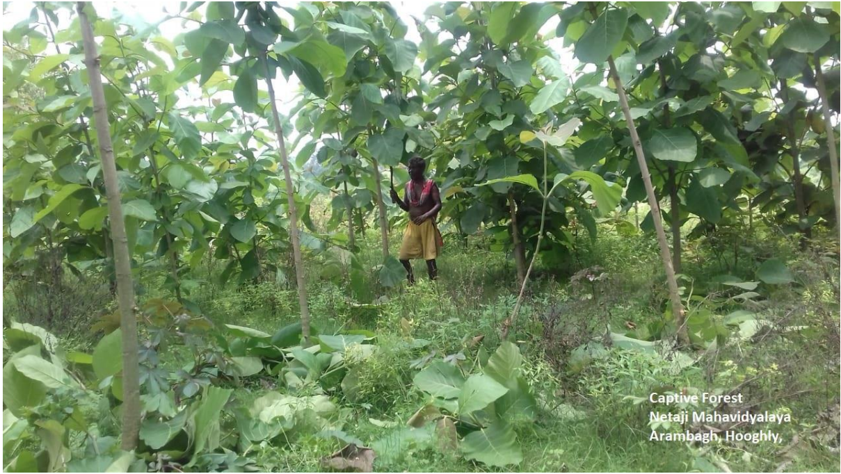
Captive Forest Netaji Mahavidyalaya Arambagh, Hooghly,