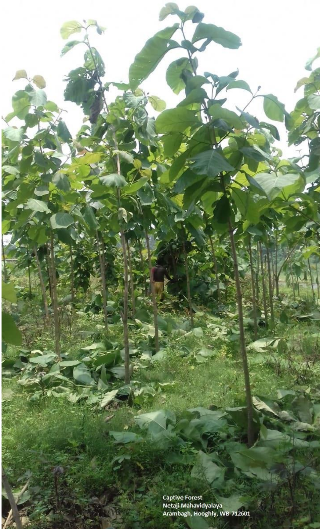
Captive Forest Netaji Mahavidyalaya Arambagh, Hooghly, WB-712601