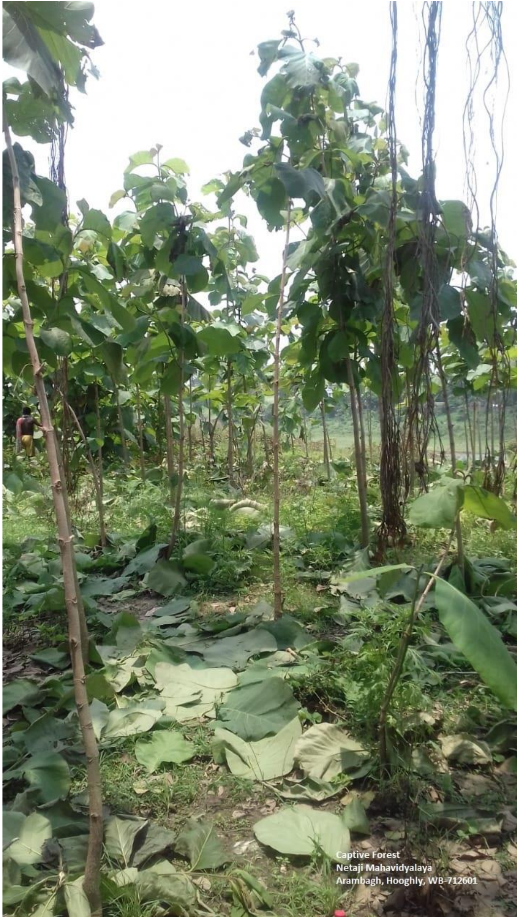
Captive Forest Netaji Mahavidyalaya Arambagh, Hooghly, WB-712601